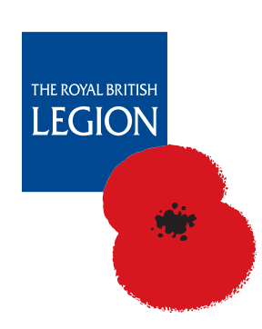
Reg Charity No: 219279

Find us at www.britishlegion.org.uk or visit your local Royal British Legion Pop In Centre