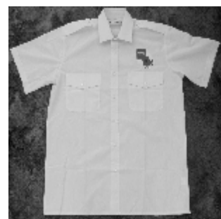
Airline shirt £12.50