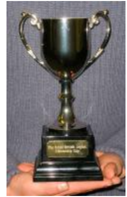
The Royal British Legion Citizenship Cup

Stamford Branch has had the honour of presenting a Citizenship Cup to the Stamford unit of 2071 Squadron ATC. The Cup will be awarded each October to the Cadet who has taken part in or organized charity collections, suggested new ideas or new ways for the Squadron to be involved with the local or wider communities.