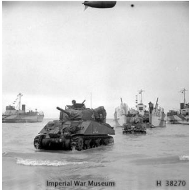
Sherman tanks driving ashore from landing craft during Exercise 'Fabius', 6 May 1944.