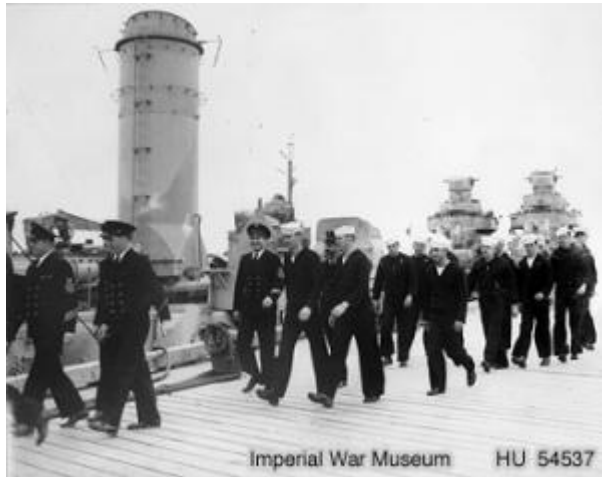
United States Navy crews at Londonderry Naval Base, 1942