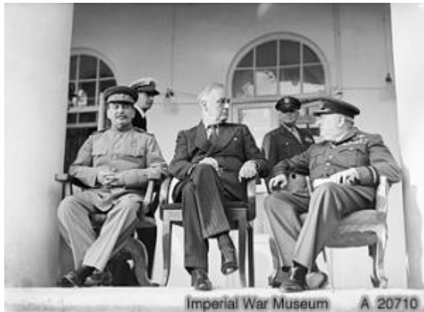
Stalin, Roosevelt & Churchill meet in Teheran 1943