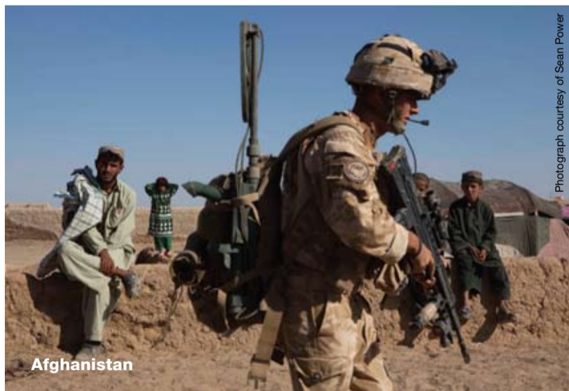
Photograph courtesy of Sean Power